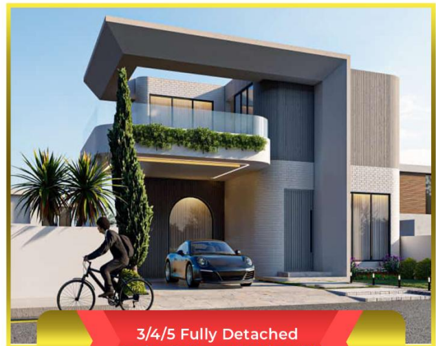
3/4/5 Fully Detached Asake Cottage Duplex+BQ