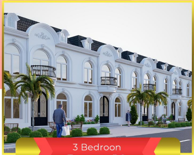
3 Bedroom Terraces+BQ